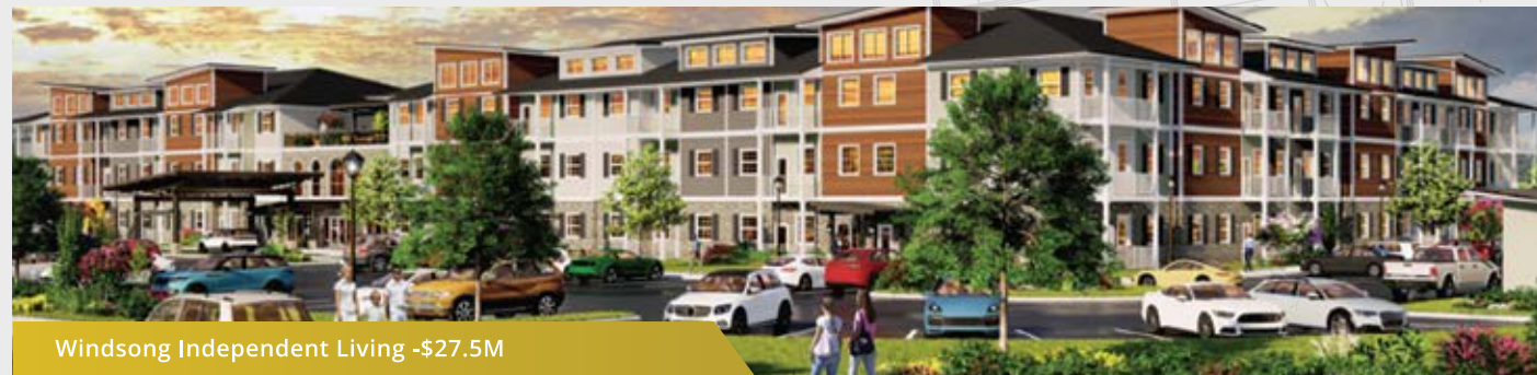
Windsong Independent Living - $27.5M