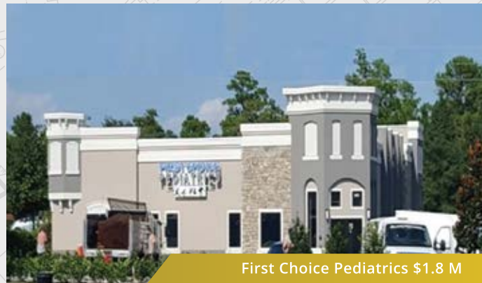
First Choice Pediatrics $1.8 M