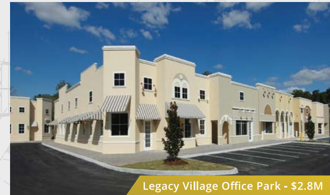
Legacy Village Office Park - $2.8M