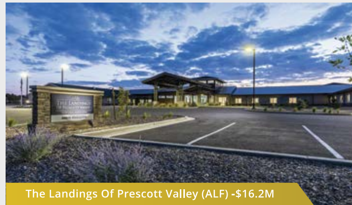
The Landings Of Prescott Valley (ALF) - $16.2M