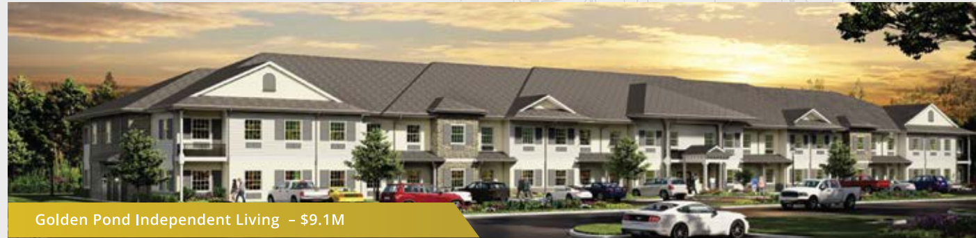
Golden Pond Independent Living - $9.1M

Senior Living | Hospitality | Medical | Industrial | Multi-Family