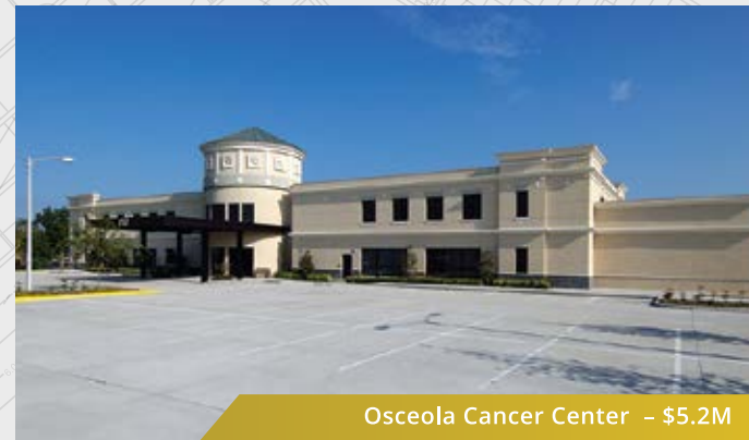
Osceola Cancer Center - $5.2M