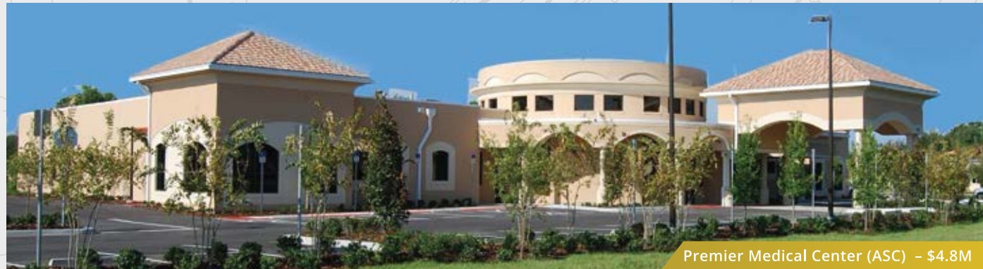
Premier Medical Center (ASC) - $4.8M