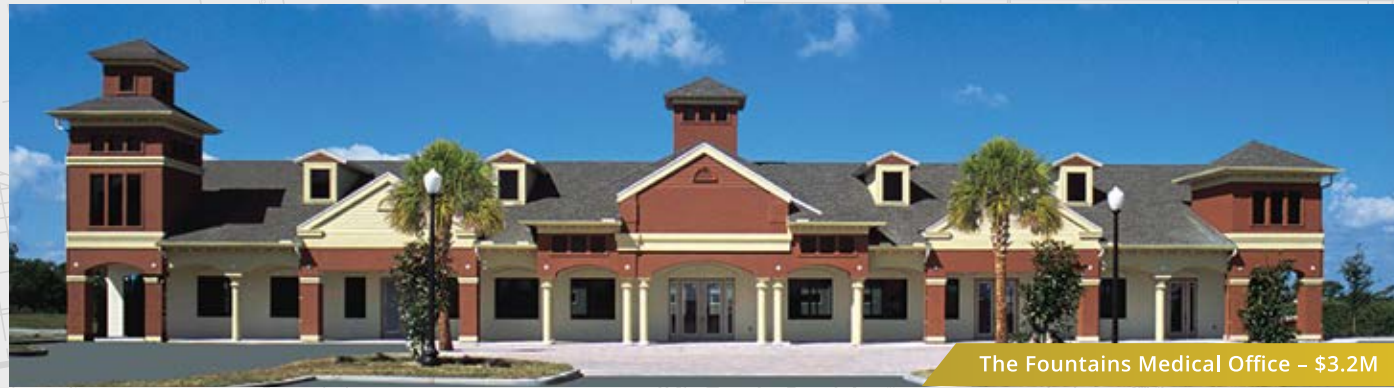
The Fountains Medical Office - $3.2M