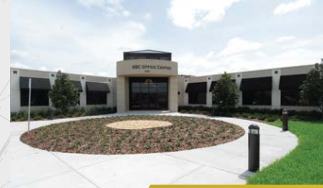
Swart Baumruk Office - $4.2M